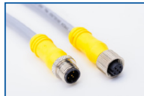
HE200CNCnnn CAN Network Cordsets (nnn=length)