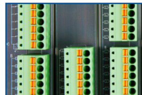
HE599TRMnnn Spring-Clamp I/O Terminals (nnn=# of positions)