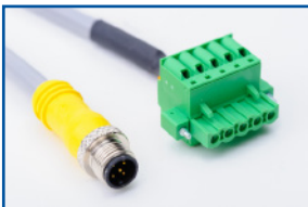
HE200CCT512 CAN Cordset Adapter & Power Tap