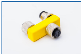
HE200CNT100 CAN Network Tee