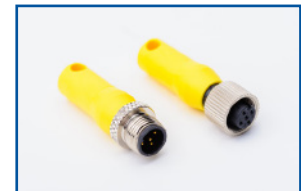
HE200CTn100 CAN Terminator (n =Male or Female)